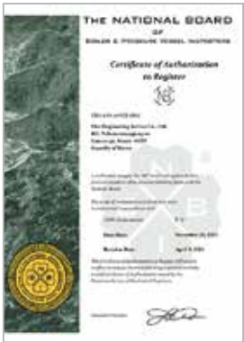
NBBI Cert. U&S