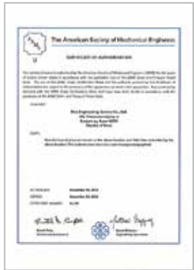
ASME Cert. U