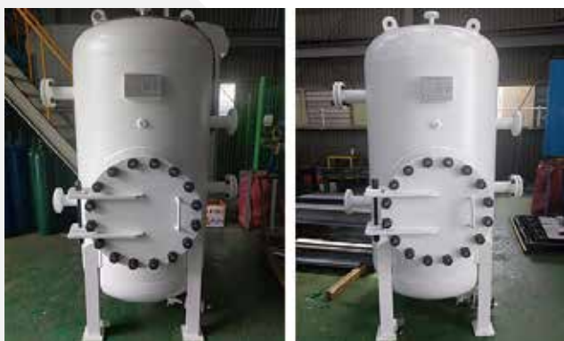
N2 STORAGE TANK