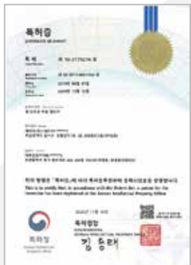
Certificate of Patent