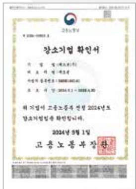
Excellent SME Confirmation