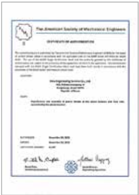
ASME Cert. S