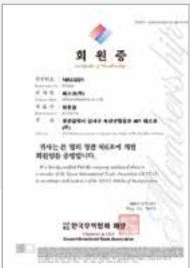
Membership Certificate of KITA