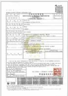
Business Registration Certificate