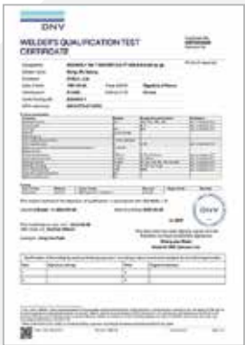
DNV Welder's Cert.