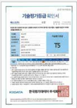
Corporate Credit Rating Certificate