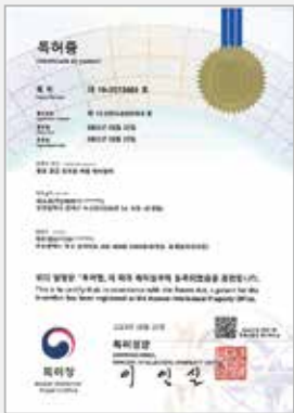
Certificate of Patent