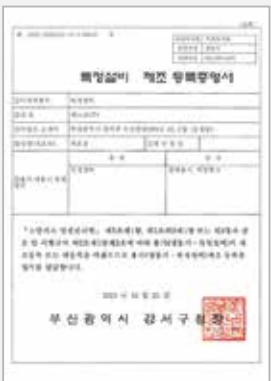
Manufacturing Certificate for Specific facilities