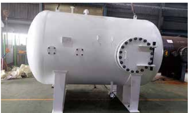
N2 STORAGE TANK